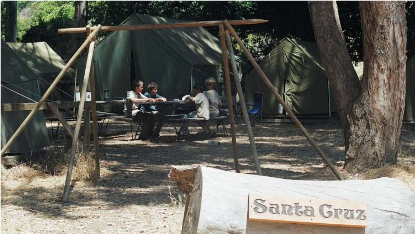
A typical day at camp. I suspect there are playing cards on that picnic table. (From 2005)