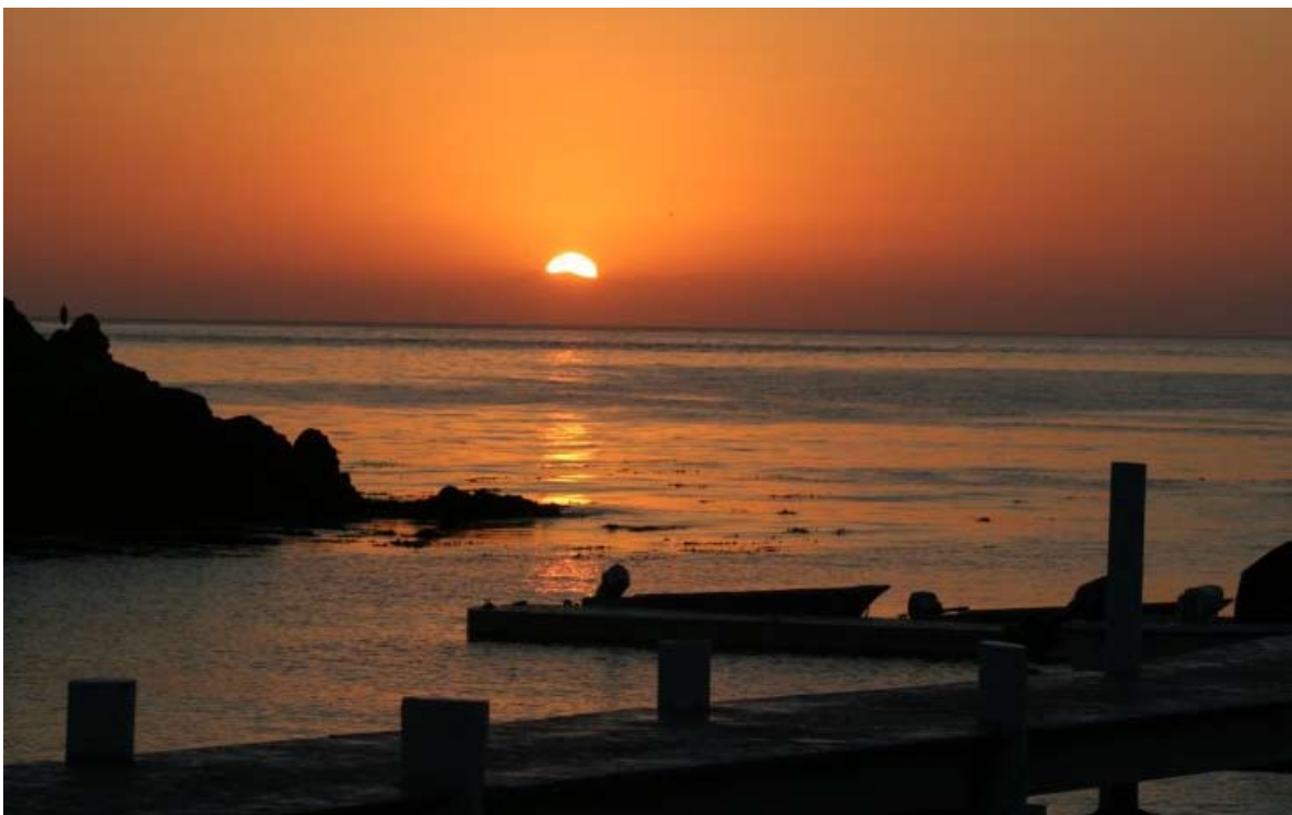
THE SUN SETS ON ANOTHER PERFECT DAY AT EMERALD BAY