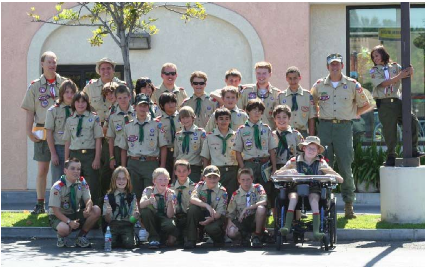
The gang all ready to jump in our cars and head up to Long Beach where we picked up the Catalina Flyer. You might not recognize some of the scouts here, but several have already achieved Eagle! (From 2006)