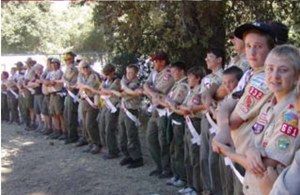
THIS SAND PAINTING OF THE ANASAZI SYMBOL (ABOVE) WON 2ND PLACE IN THE SAND PAINTING CONTEST. MEANWHILE, IT'S ARROWMEN, ARROWMEN AND MORE ARROWMEN (LEFT) GATHERED FOR THE ANNUAL ORDER OF THE ARROW POW WOW EVENT HELD AT LOST VALLEY THE WEEKEND OF SEPTEMBER 10, 2010.